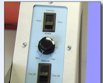
Speed Control & FWD/REV