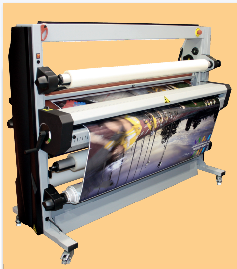
Rear Takeup for Roll-to-Roll Lamination