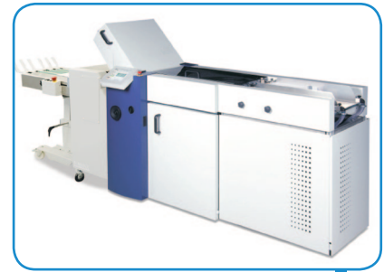
FD 2300 air-feed

** Three phase power is required. NOTE: The FD 2300-EX model requires both a 3-phase 220V outlet and a second separate 220V outlet (single phase) for the extended airfeed deck.