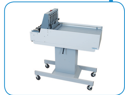
Optional V-Stack36 Vertical Stacker with adjustable-height stand

Formax – New Hampshire, USA www.formax.com