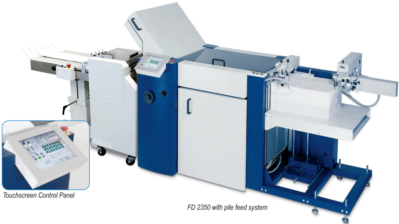
Touchscreen Control Panel