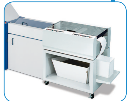
FD 2380 with in-line FD 676 Burster