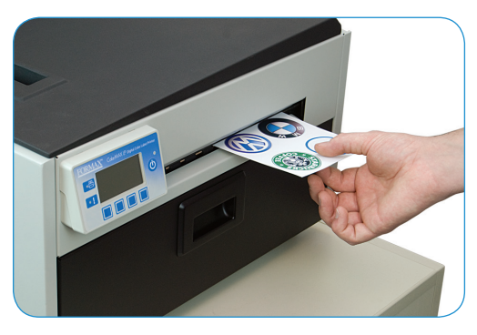
Three Output Modes / Built-in Cutter

Users can choose between Roll-to-Cut, Roll-to-Roll or Print and Hold modes, based on quantity and output needs. Print and Hold mode pauses to allow users to remove individual labels one at a time. The built-in automatic cutter makes processing even more efficient.