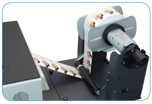
Optional Rewinder The motorized Rewinder allows users to print and process traditional roll-to-roll labels, rewinding face-in or face-out, for convenience.

Users can choose between Roll-to-Cut, Roll-to-Roll or Print and Hold modes, based on quantity and output needs. Print and Hold mode pauses to allow users to remove individual labels one at a time. The built-in automatic cutter makes processing even more efficient.