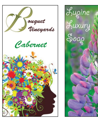
2" x 4" Wine Label