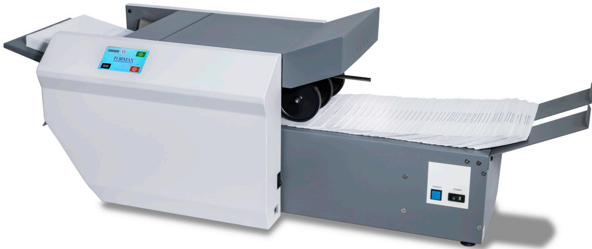
FD 2036 shown with optional conveyor

The FD 2036 AutoSeal ® is a user-friendly high-volume solution for processing one-piece pressure sensitive mailers. The color touchscreen control panel uses internationally-recognized symbols in place of text, and includes a six-digit resettable counter. With a speed of up to 11,000 forms per hour, hopper capacity of up to 350 forms, and the ability to process forms up to 14" in length, the FD 2036 enables operators to complete daily processing jobs with ease.