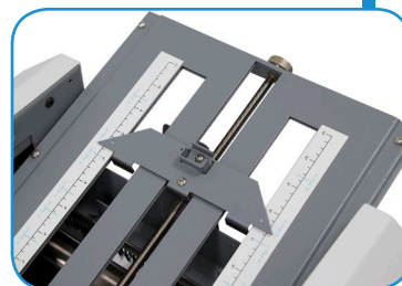
Clearly marked fold plates are easy to adjust