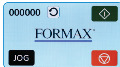
Touchscreen control panel is graphics-based making it easy for anyone to use