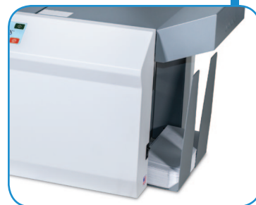
Standard Catch Tray