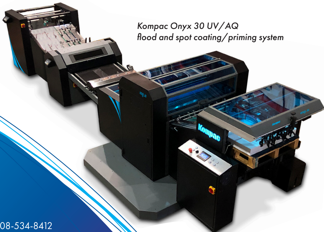
Kompac Onyx 30 UV/AQ flood and spot coating/priming system

Kompac Technologies, LLC 7 Commerce Street Somerville, NJ 08876