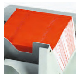
Flat booklets are easy to handle, stack and pack.