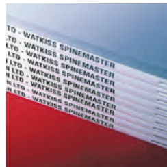
SquareBack booklets can carry print on the spine, just like a perfect bound book.