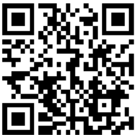
EXP 42+ Video: Scan the code using a QR code reader or visit YouTube.com/DKGroupInc