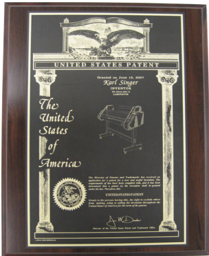
Patent Information US D544,893 S Laminator