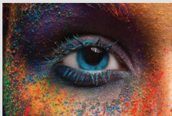
Nozzle Recovery System

Automated monitoring of printhead performance and clogged nozzles