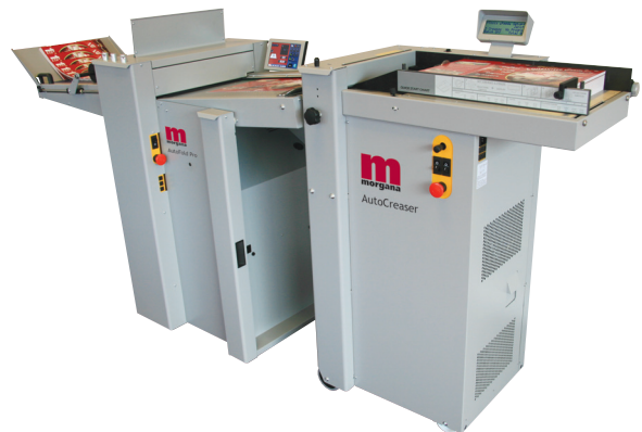
Picture shows AutoFold Pro with Morgana AutoCreaser

The beauty of the AutoFold Pro is its simplicity allowing the user of ANY manufacturer's creaser to invest in one and to improve their productivity and quality immediately.