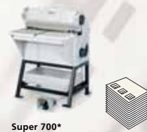
Super 700* High performance electric punching and perforating machine. Working width 700mm Changeable tooling Book heights up to 4.5mm** Output – up to 500 cycles per hour***