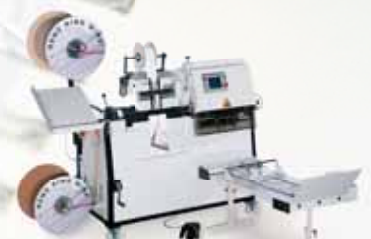
Optional: MOBI 500 with shingle conveyor KA 300 calendar hanger dispenser