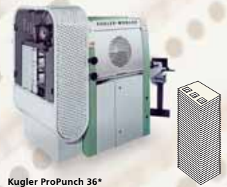
Kugler ProPunch 36* Fully automatic punching and perforating machine. Working width 360 x 360mm Changeable tooling Book heights up to 3 mm** Output – up to 150 cycles per minute***