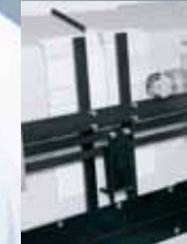
KA 300 Calendar hanger dispenser for automatic feed of loose calendar hangers (80-300 mm long).