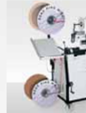
Automatic spool take-up with integrated separating paper winding for easy processing of all wire sizes. Separating paper winding system reduces the amount of waste produced.