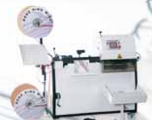
Standard: MOBI 500 with cover box