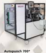
Autopunch 700* Fully automatic punching and perforating machine. Working width 360 x 360mm Changeable tooling Book heights up to 3.5mm** Output – up to 100 cycles per minute***