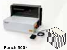
Punch 500* Table top electric punching machine Working width 500mm Changeable tooling Book heights up to 4mm** Output – up to 500 cycles per hour***

We offer the right solution for all cover heights, according to customer requirements