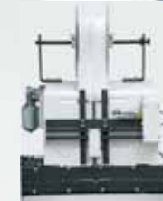
KA 300R Calendar hanger dispenser for automatic feed of calendar hangers on a roll (80-300 mm long). Loose calendar hangers can also be processed using this dispenser.