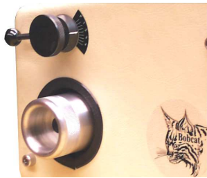
Pitch Depth Control and Safety Hand