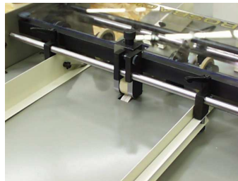
Positive Feeding Caliper