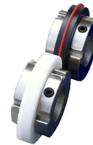
TrueScore-Pro Scoring Heads