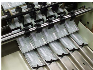
Delivery Dividers Available for Strips, Cards, and Tickets