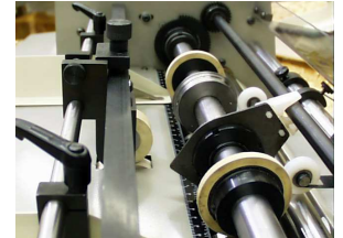
Standard Precision Rosback Heads