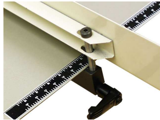
Quick-Lock & Micro Adjust Side Guides for Fast Setups