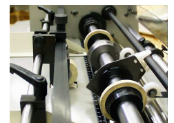
Standard Precision Rosback Heads